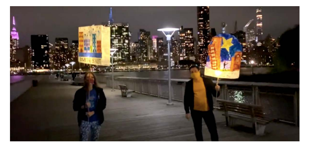
Participant photos from Morningside Lights 2020

<u>Morningside Lights</u> returns for its 10th year, and invites the public to come out and PLAY by taking part in the virtual procession of awe-inspiring handmade lanterns. Columbia's <u>campus-wide exploration</u> of Duke Ellington's Shakespearean suite "Such Sweet Thunder" provides the creative backdrop for the community to explore how one links established literary and cultural canon to personal experience.