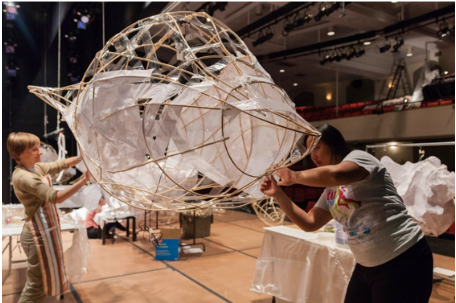
Morningside Lights Lantern Building Workshop