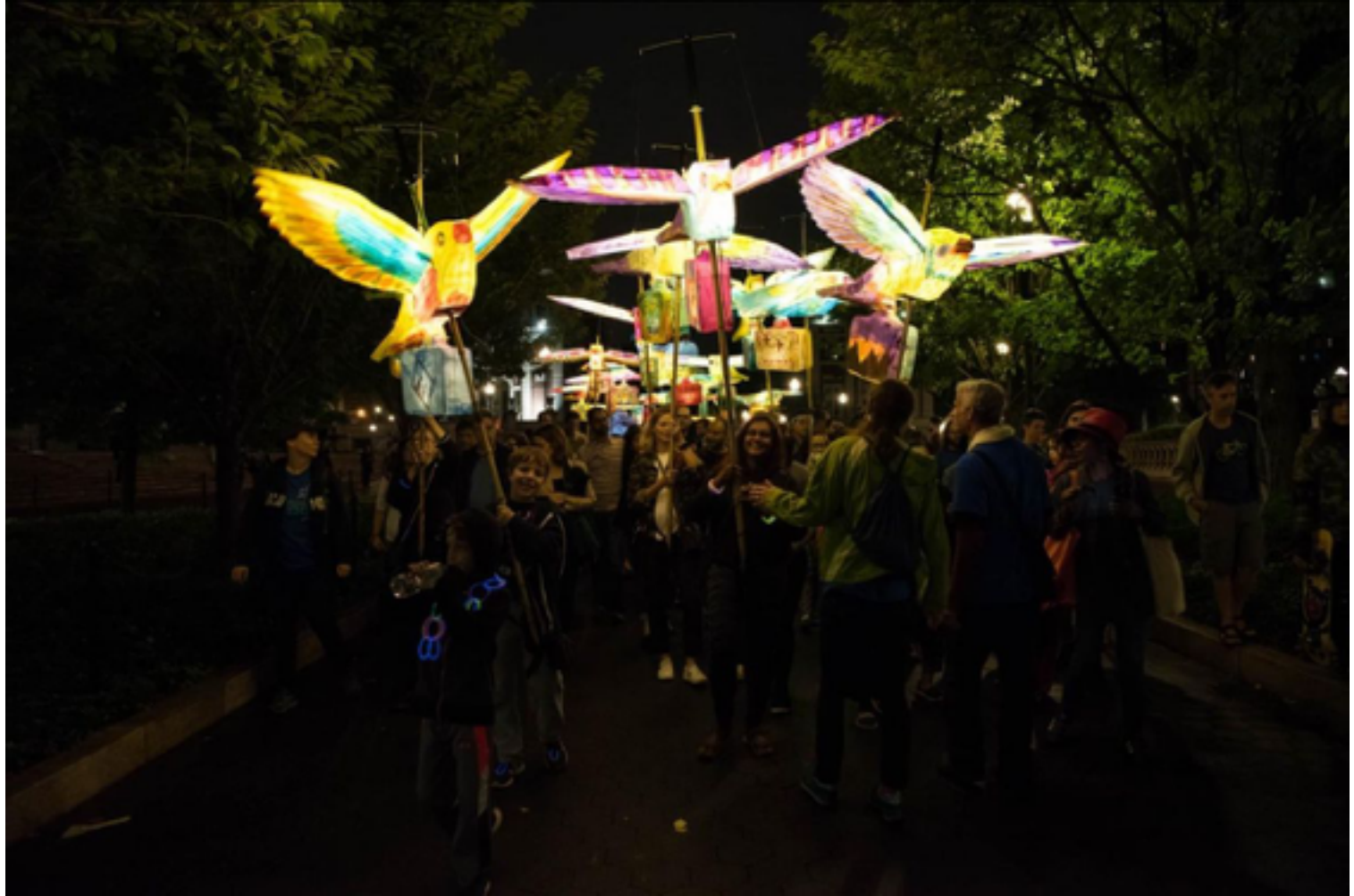
Morningside Lights Procession 2018