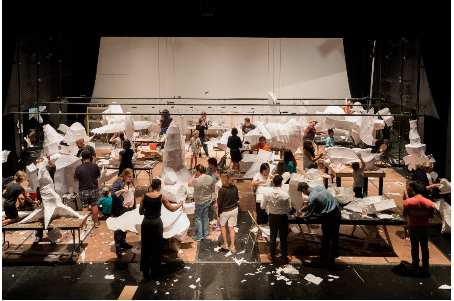
Lantern Building Workshop on the stage of Miller Theatre 2016