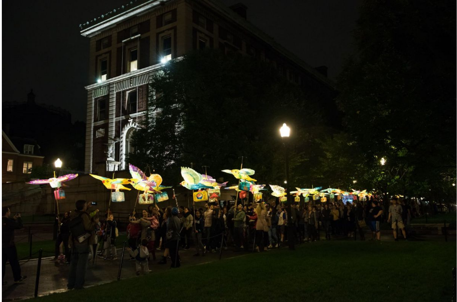
Morningside Lights Procession 2018; Photo by Michael Seto